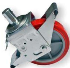
8" Caster Wheel with Dual Brake