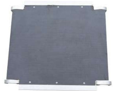
Antislip Working Platform 60 x 60 cm